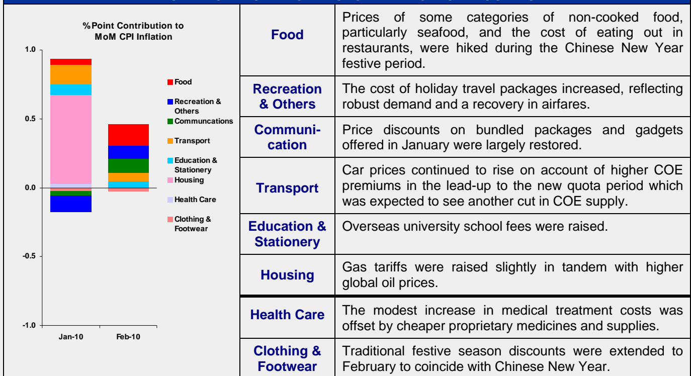
MONTH-ON-MONTH CHANGES IN KEY CPI CATEGORIES

The CPI rose by 0.4% m-o-m in February 2010, due largely to higher costs of food and recreation.