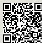
Handbook on Implementing Environmental Risk Management